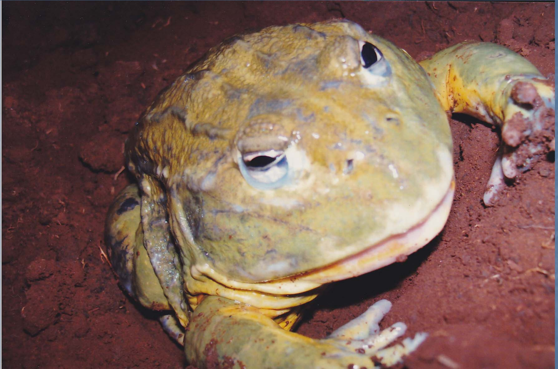
Bullfrog - Pyxicephalus adspersus