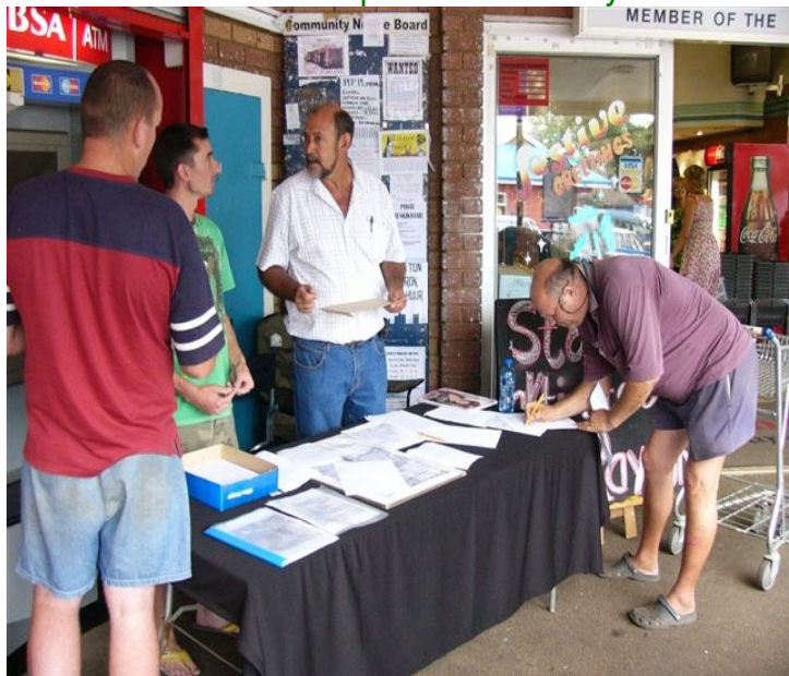
Die boere is kwaad, baie kwaad. sign-up